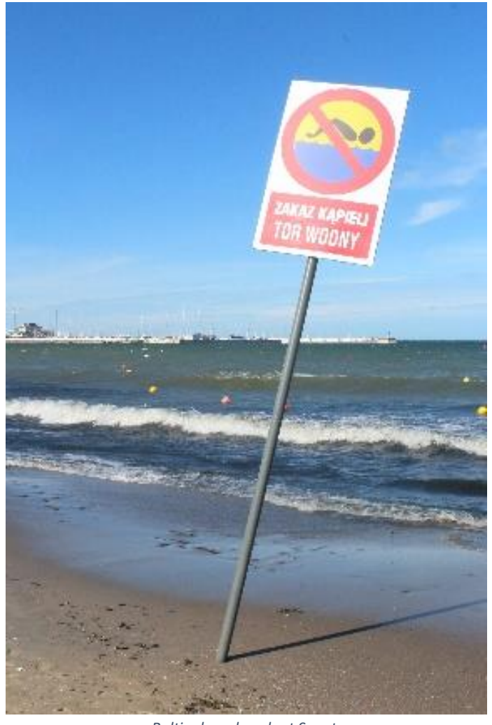
Baltic shore beach at Sopot.

I had read that many large, cheap pieces of amber that have bugs in them could be insects inserted into melted plastic. So, the time I pulled out a hair and did the static-electricity test on a big piece, the vender assured me in broken English that it was authentic. My French-horn friend said anything like