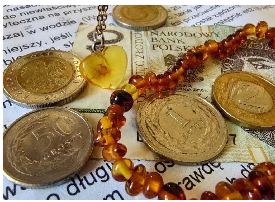
My amber pendant and bracelet

After times of music and ministry over the next week, we got to see the shops in oldtown Gdansk,