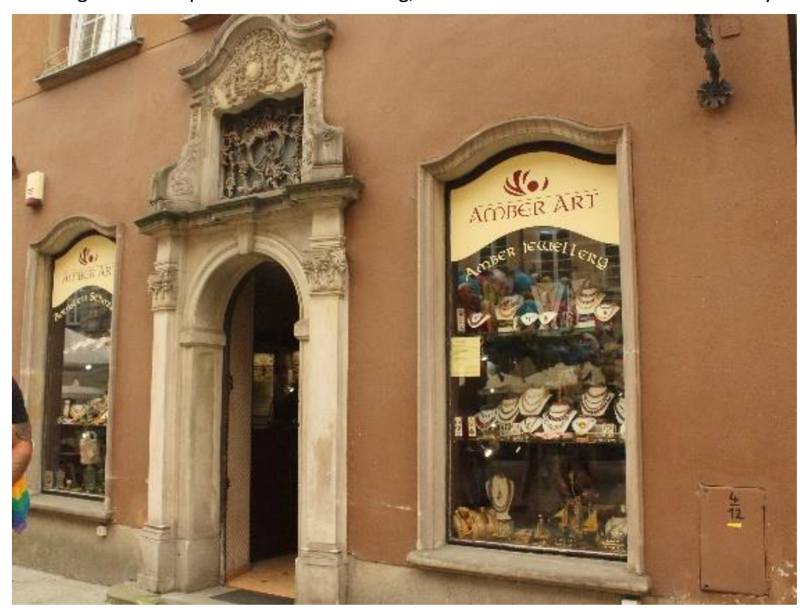
Amber shop in old-town Gdansk

and in old-town Warsaw. There were fine jewelry stores, and many little shops that included amber things. I was skeptical of some of the big, beautiful treasures. The three tests my friend